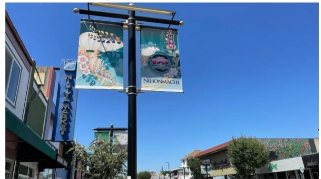
This beautiful neighborhood is full of history, culture, and fun things to do.

Japantown Walking Tour: Did you know that prior to WWII, there were over 40 Japantowns in California alone? Of these 40, San Jose's Japantown is one of only three remaining Japantowns in the United States today. San Jose Japantown has a unique and multicultural history rooted in Heinlenville Chinatown, Post-WWII Japanese American resettlement, and as a shared neighborhood in the early 1900s with the Filipino community (Pinoytown), to name a few of the major influences. Take a trip through Japantown's past and present with an experienced JAMSj Docent and learn more about the history, memories, and personal accounts that make this Japantown so special.